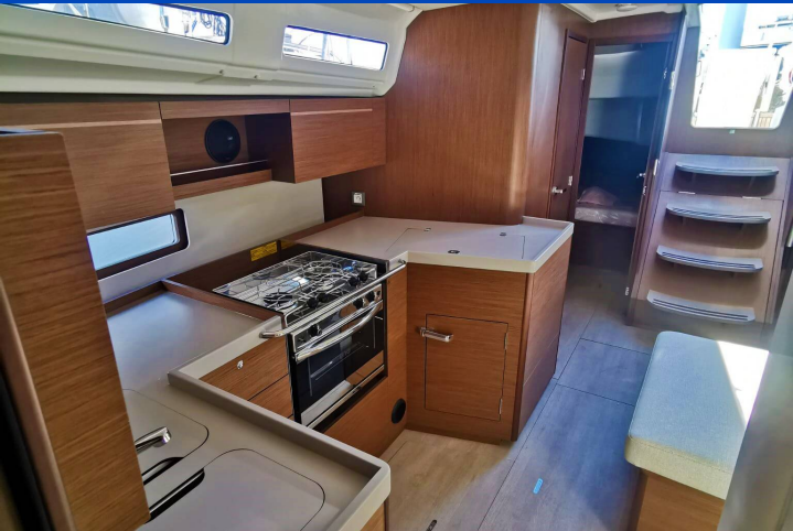
Oceanis 40.1 - layout 4 CABINS & 2 HEADS

The Sailing yacht Oceanis 40.1 Dory homeport is Pula, ACI Marina Pomer, Croatia. Built in 2024, and accommodates up to 8 + 2 persons in 4 cabins, and has 2 heads.